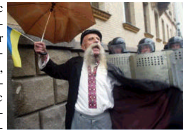
An old man wearing a typical Ukrainian shirt and waving the national flag, argues with the police standing in line.

The most important question of Ukraine's history still stands – either with Russia or with Europe.